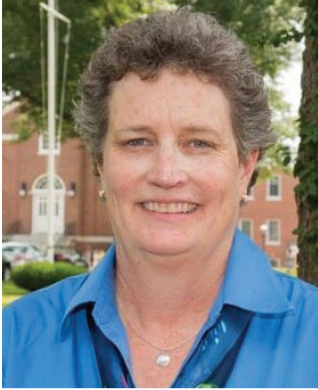
STATE SENATOR BETH BYE